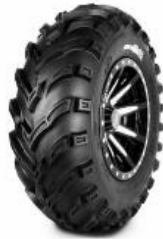
DIRT DEVIL DIRT DEVIL DIRT DEVIL

This 6-ply rated tire's compound was reformulated with more natural rubber. Traction spikes were added for ultimate grip and durability in a wide range of terrain, light mud, dirt, gravel and hard pack. Each lug is dimpled with more biting edges for better traction and stability. All Terrain 21 Sizes 6-Ply Rated Our Most Popular Tire Terrific Value Great High / Low Speed Traction