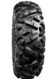
DIRT TAMER DIRT TAMER DIRT TAMER

This popular performance 6-ply rated tire boasts a bold non-directional tread design that promotes exceptional traction in all types of terrain. The Dirt Tamer offers serious puncture resistance and its tread lugs run deep into the sidewall for added protection. All Terrain 6 Sizes 6-Ply Rated Exceptional All Terrain Traction Popular Non-Directional Tread Design Extra Strong & Durable